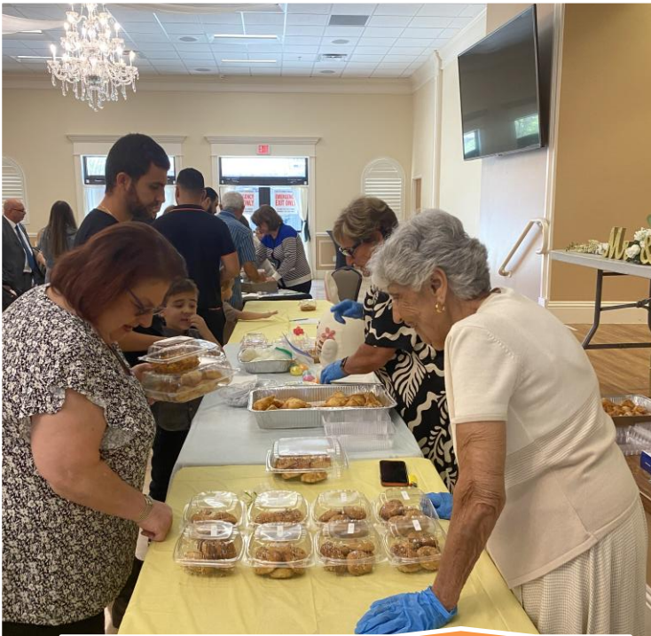
Palm Sunday Bake Sale