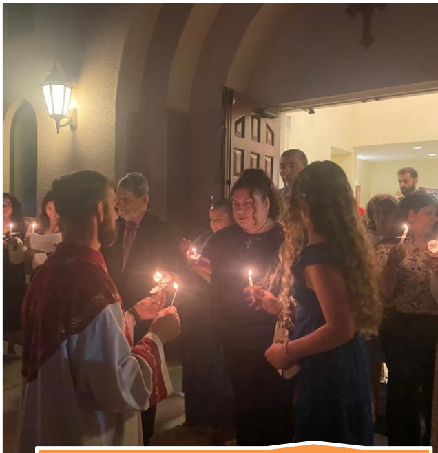
Easter Eve Worship