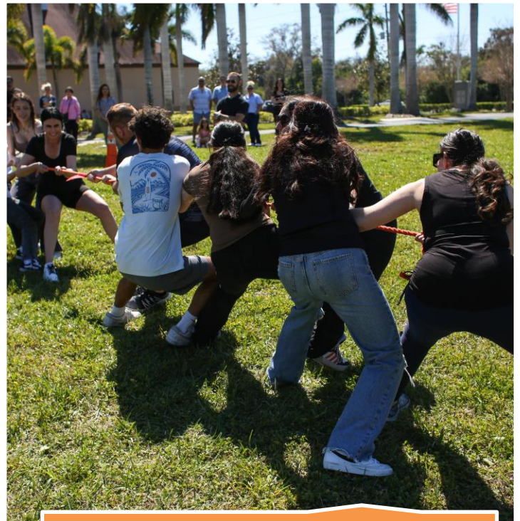
Fit Fest-Field Day