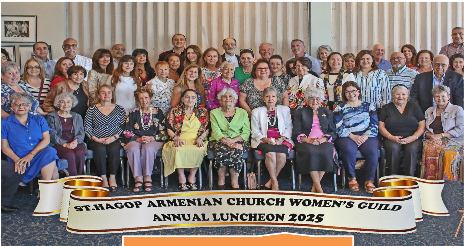
Women's Guild Spring Luncheon