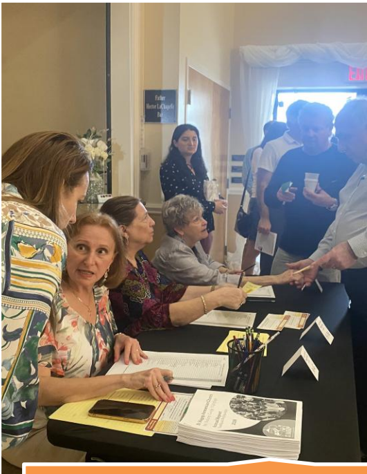
Annual Parish Assembly