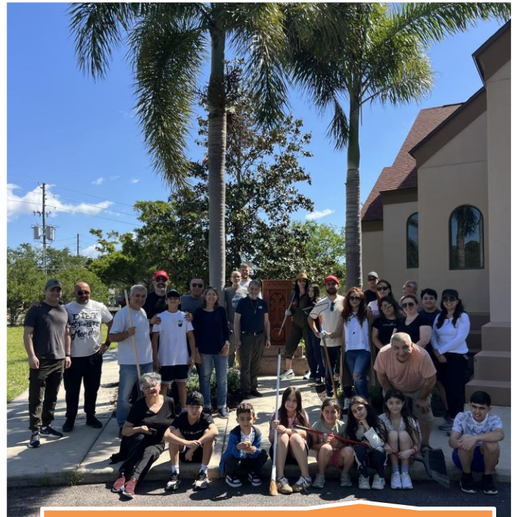
Palm Sunday Clean Up