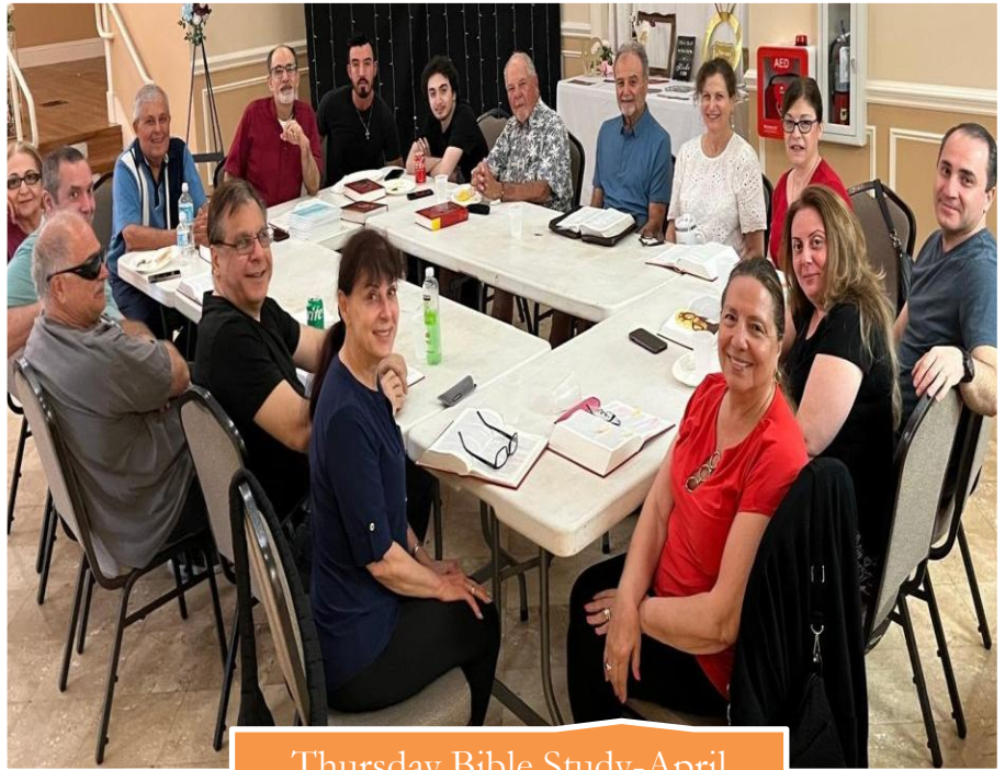
Thursday Bible Study-April