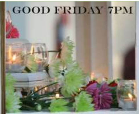
Good Friday Burial Service Fri. Apr. 14 | 7 PM