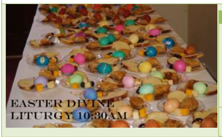
Easter Divine Liturgy Sun. Apr. 16 | 10:30 AM