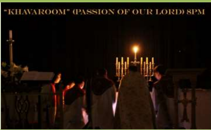
"Khavaroom" (Passion of our Lord) Thur. Apr. 13 | 8 PM