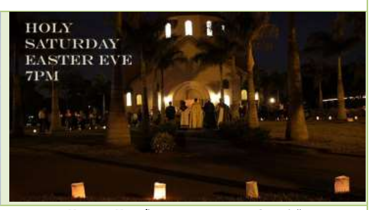
Easter Eve "Jragalooyts Badarak" Sat. Apr. 15 | 7 PM